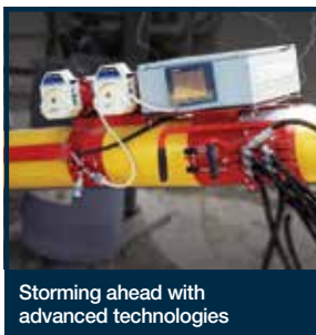
Storming ahead with advanced technologies

No matter which seed treatment product or crop, Bayer SeedGrowth can help you find the right equipment solution to effectively meet your needs. Whether it is new commercial soybean treaters or modifying existing equipment Bayer can help. In 2014, Bayer partnered with Ag Growth International (AGI) to co-design the NEW STORM Seed Treater, the first of its kind for computerized, self-adjusting/metered, in-yard seed treatment for cereals.