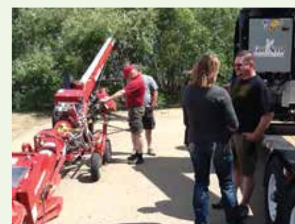
Hands-on training at the Camrose Facility